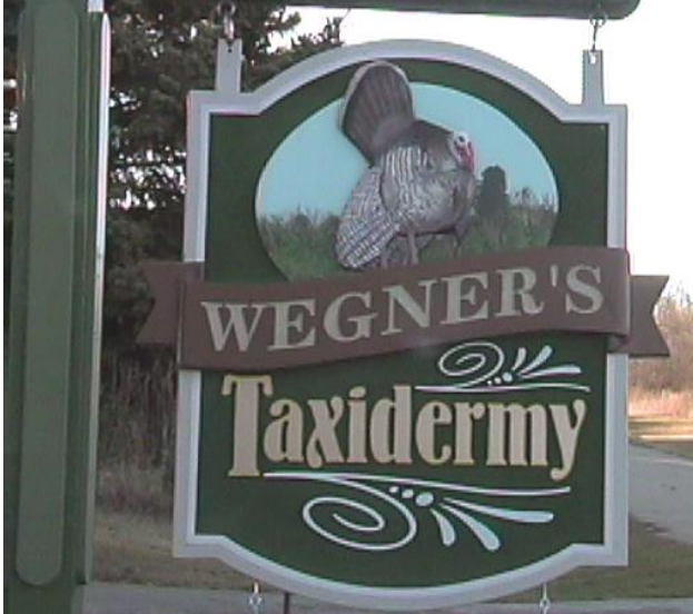
Wegner's School of Taxidermy 2214 E. Manogue Rd. Milton, Wisconsin. 53563